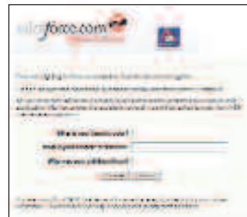
Q&A during 'forgotten password' process