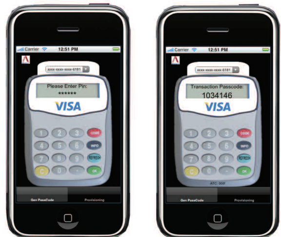
The user can use their mobile phone to automatically generate the one-time passcode required to gain access to their account or to complete the payment transaction

When the user makes a web purchase or logs into an online account, the experience is identical to the conventional DPA solution. The user gets out the mobile device, runs the ArcotOTP application, enters the PIN, and generates the dynamic passcode. Just as with the traditional disconnected reader, no wireless or other connectivity is needed. ArcotOTP can store and authenticate multiple cards at once. Users can easily select the card that they want to use. ArcotOTP will generate the correct passcode for the selected card. In addition, the correct card brand will be displayed on the card reader image on the phone.