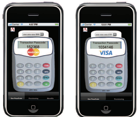
The user can use their mobile phone to automatically generate the one-time passcode required to gain access to their account or to complete the payment transaction

When the user makes a web purchase or logs into an online account, the experience is identical to the conventional CAP/DPA solutions. The user gets out the mobile device, runs the ArcotOTP application, enters the PIN, and generates the dynamic passcode. Just as with the traditional disconnected reader, no wireless or other connectivity is needed. ArcotOTP can store and authenticate multiple cards at once. Users can easily select the card that they want to use. ArcotOTP will generate the